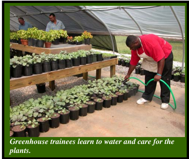
Greenhouse trainees learn to water and care for the plants.

The City of Evergreen has contracted with the Center to provide plants for winter landscaping. The Center will grow several varieties of pansies that the City will use around city hall, in the park, and in various public areas. Millender says, “It’s great to have the product sold in advance.”